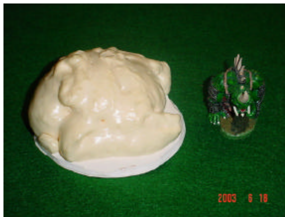
Anyways, now we have a bunch of basic rocks, which look pretty much like this:

When it comes to painting, Great Stuff does not take paint well. The first coat is problematic, and tends to bead off, as you can see from the picture below. That is actually the