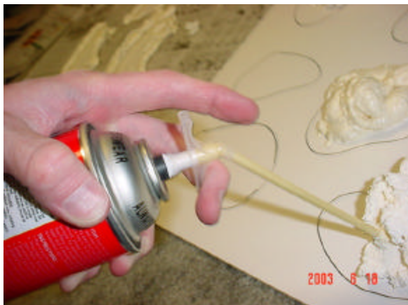
many things you can make per can, it's very cheap.

Let it dry. I wait a full day. It'll change color a bit, but it's still basically a pale yellow. It does expand, as you can see. Most of the expansion happens in the first half hour, but I think it expands for close to two hours. I've never actually timed it though.